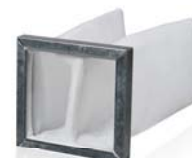
SFK replaceable filter